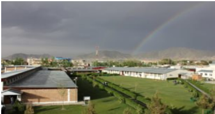
American University of Afghanistan