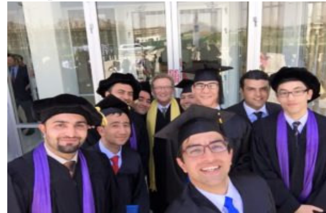
AUAF 2016 Graduation

about the future of the country — cannot back down to insurgents and criminals who threaten a future of possibility.”