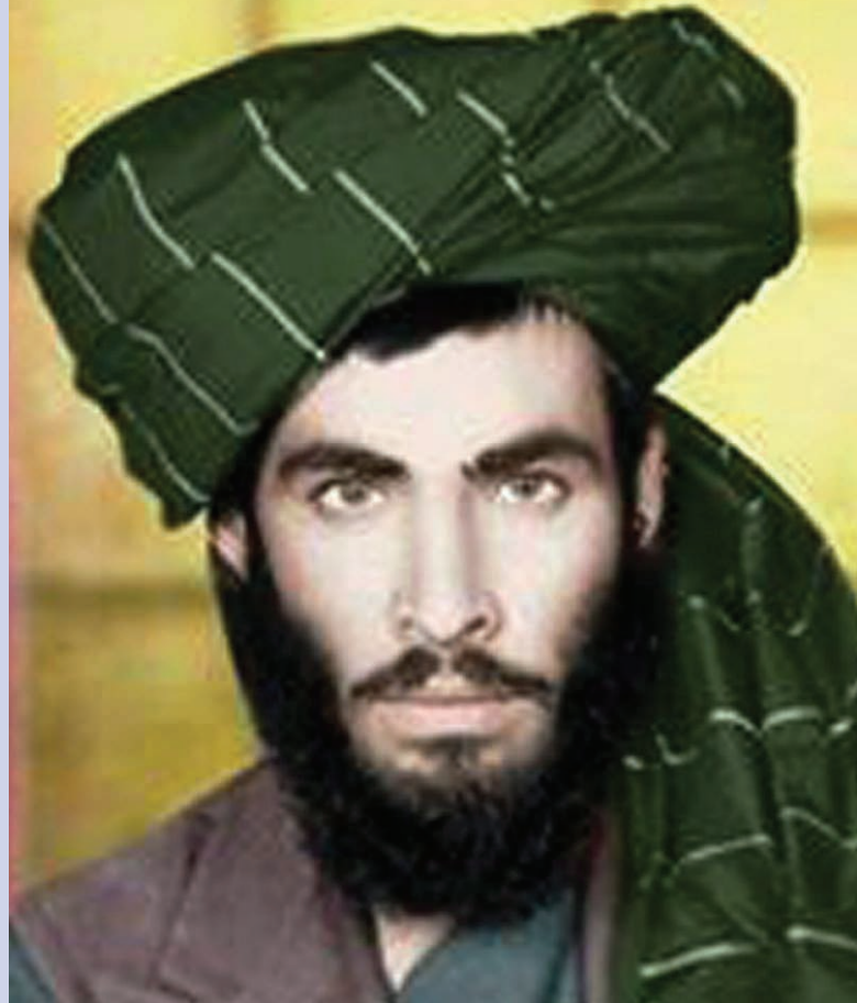
Clockwise from right: Mullah Omar in 1978, 1992 and 1996.