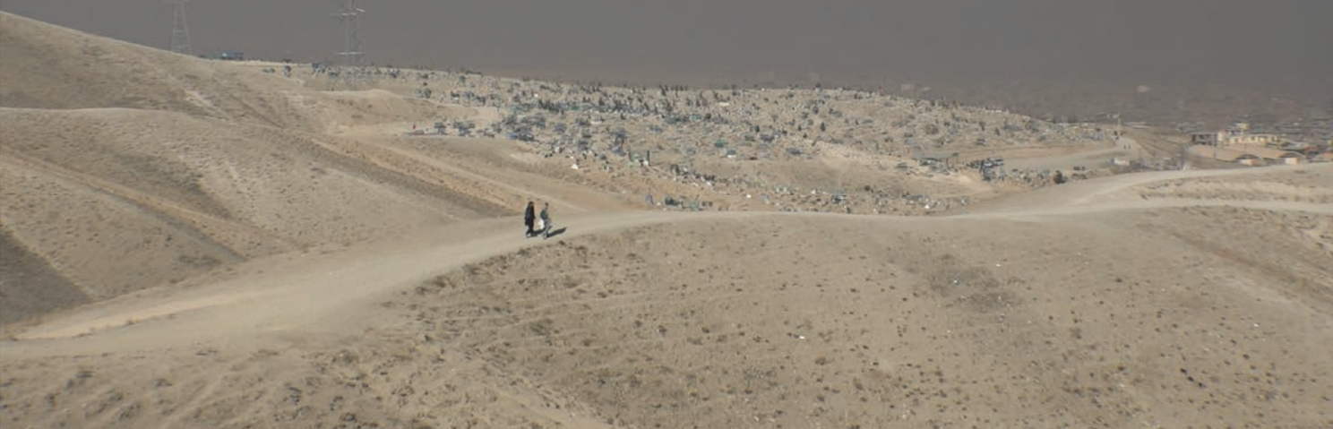
Haji Nabi Hills, Southwest Kabul, Afghanistan.

southern Afghan heartlands. This type of charisma was based not on eloquence or fiery soundbites, but rather by cultivating the perception of an otherworldly, selfless, guileless persona that seemed to many Talibs the antidote to the corrupted materialism around them. The contrast to the worldly Osama bin Laden could not be greater. In this sense, the story of Mullah Omar shows us just how different the Taliban and al-Qaeda really are. Today, as the prospect of peace hinges, in part, on trusting whether the Taliban can indeed split with al-Qaeda, understanding Mullah Omar's story is more crucial than ever.