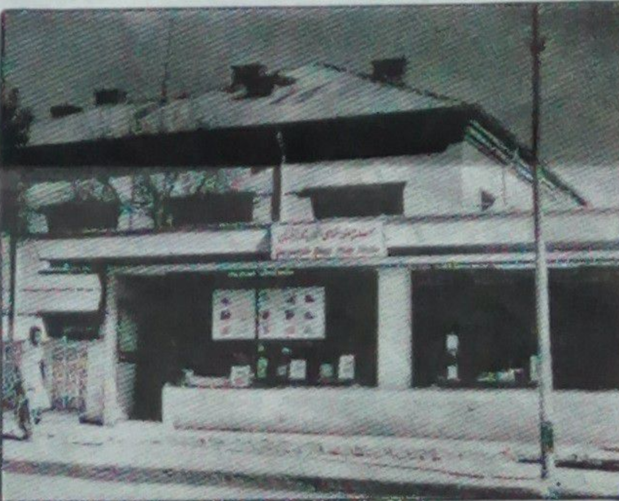
Photo studios of the Union.