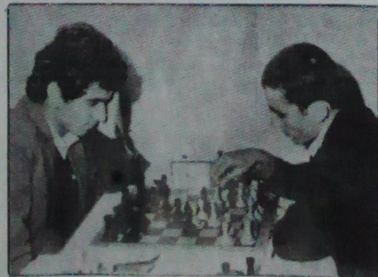
A chess match is progress in the Chess Central Club.

They or their authorised representatives should attend the bidding on April 1, 1987, which is the last day for bidding. Specifications and conditions can be obtained. Bidbond is necessary. (182) 2-2