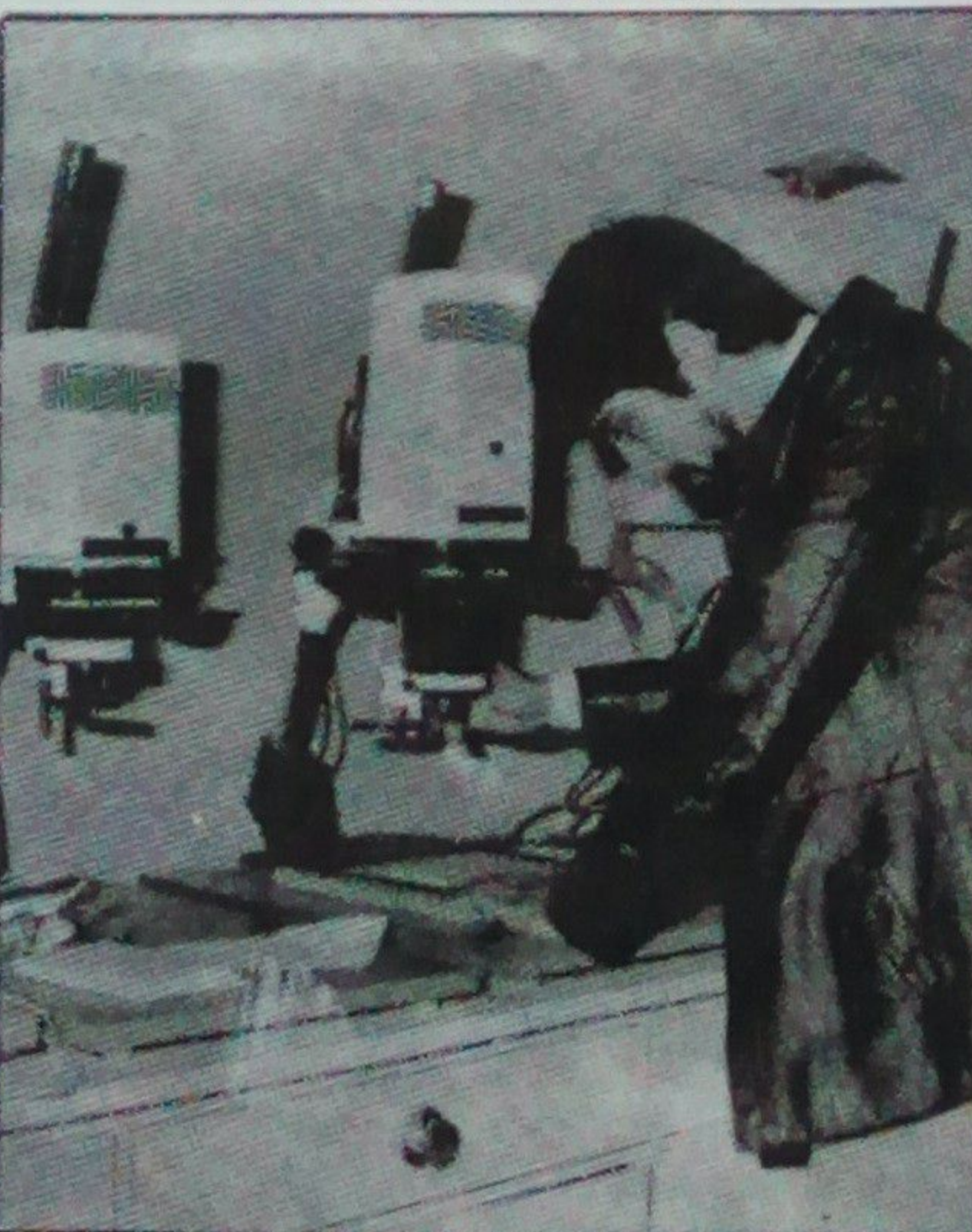
Headquarters of Journalists' Union.