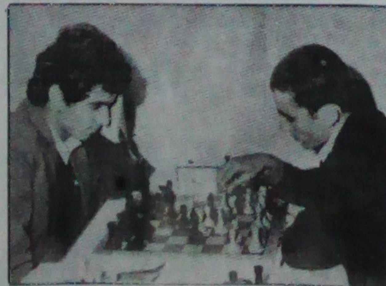
A chess match is progress in the Chess Central Club.