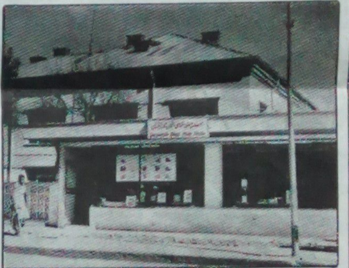
Photo studios of the Union.