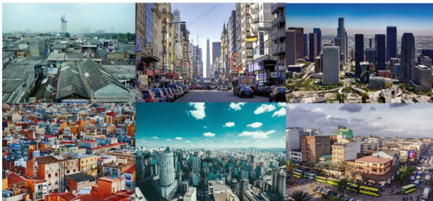
Fig. 1 The structural and spatial heterogeneity of cities, including cultural and political differences, complicates the application of one overall organizational solution for data management and administrative problems in general

The difficulty in this study originates from the circumstance that there are thousands of cities, yet none of them are spatially or morphologically identical (Fig. 1) nor do they share a common base in organizing their RS data (if present) or their geodata, respectively. They do share an administrative background in whatsoever form. Nevertheless, the existence of an administrative unit or governmental order does not necessarily indicate the (distribution of) responsibilities and tasks therein. In general, the administrative organizations and the definition of their competences are mostly intangible for people outside these organizations. Further, as later presented in the result section, the distribution of competences is not as crisp as it may appear from the outside when it comes to, for example, the acquisition of RS data, the production of maps, and the provision and distribution of available RS data. Recently, there has been an ongoing shift (Agrawal et al. 2014) in governmental and citizens’ awareness toward the open government, open data, or government transparency initiatives in general. By means of these tools and policies,