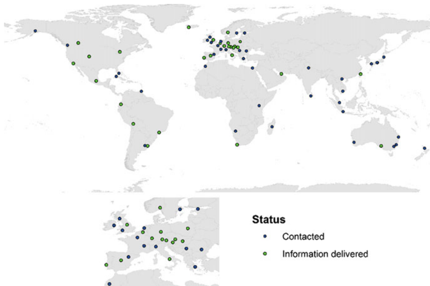
Fig. 1.1 World map of contacted cities and institutions

through contractors or available online (list of websites: cf. Appendix Table A2). The website quality of the contacted municipalities or respective institutes, who are responsible for the management and distribution of RS data and resulting products, strongly deviates; the same holds true for the quantity of the provided information through these websites. Ancillary data and background information presented in the tabulated summaries of the particular cities and institutions contacted are derived as follows: