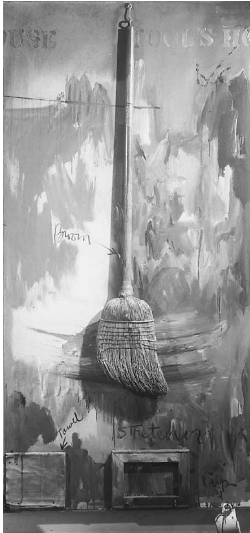
5. Fool's House (1962) by Jasper Johns. Language, theory, the object, and art. Is this a paint brush?