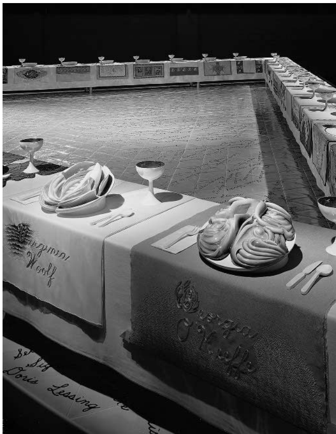
14. The Dinner Party (1979) by Judy Chicago. A feminist symposium: but are the identities of the participants constrained by the imagery used to 'represent' them?