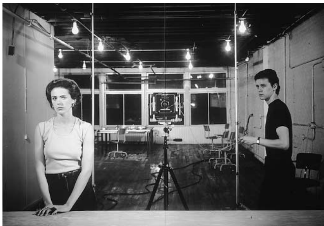
11. Picture for Women (1979) by Jeff Wall. Who looks at whom, at what angle, and why?