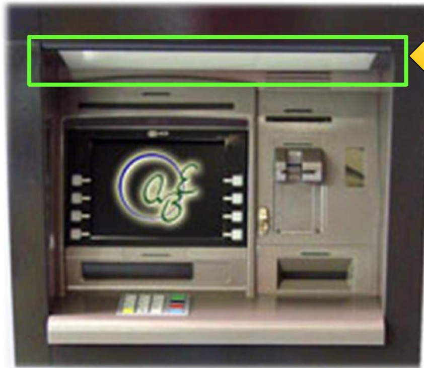
Photo shows a PIN capturing device fitted to the top of the ATM. These devices are usually difficult detect.