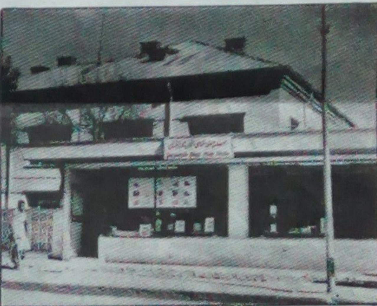
Photo studios of the Union.