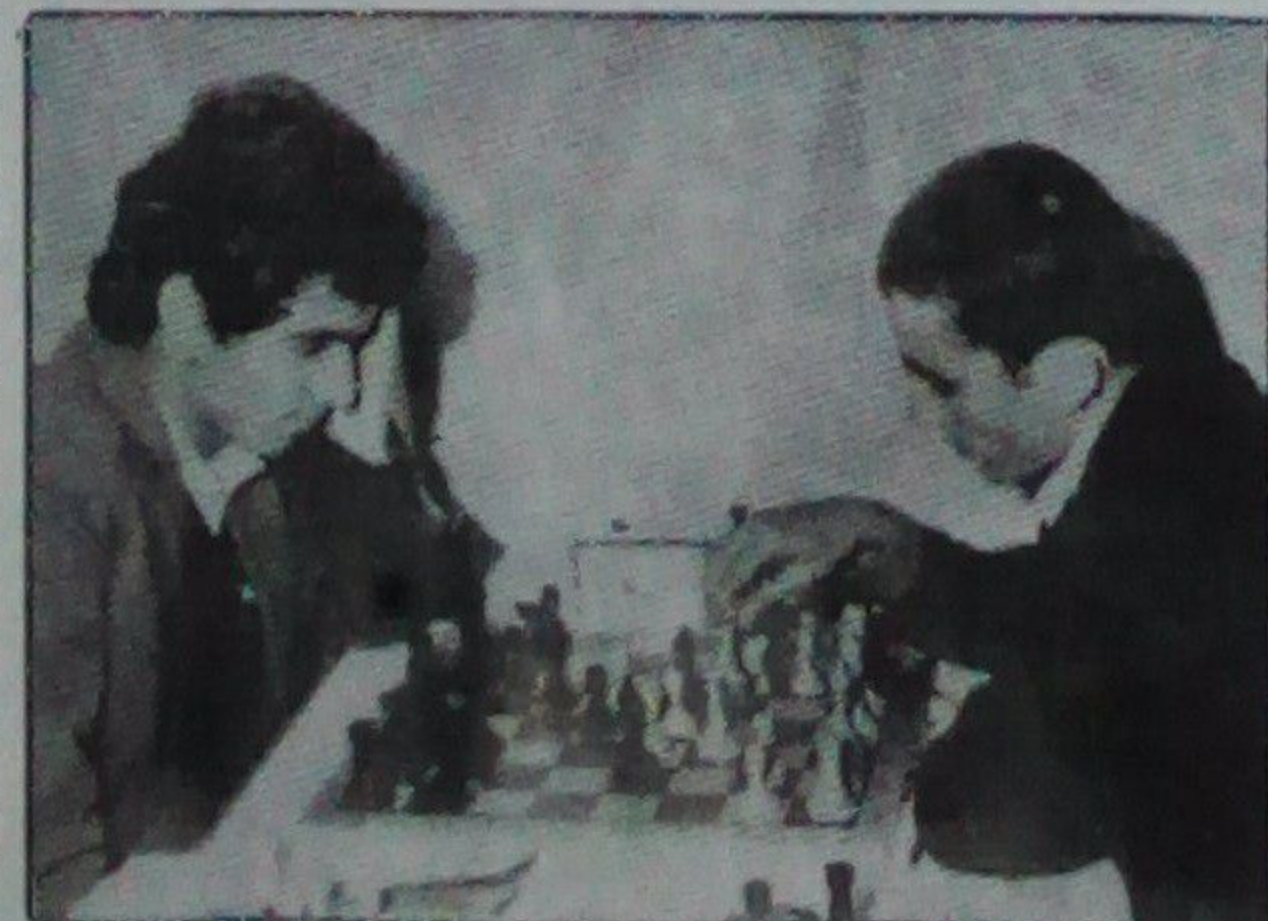
A chess match is progress in the Chess Central Club.

They or their authorised representatives should attend the bidding on April 1, 1987, which is the last day for bidding. Specifications and conditions can be obtained. Bidbond is necessary. (182) 2-2