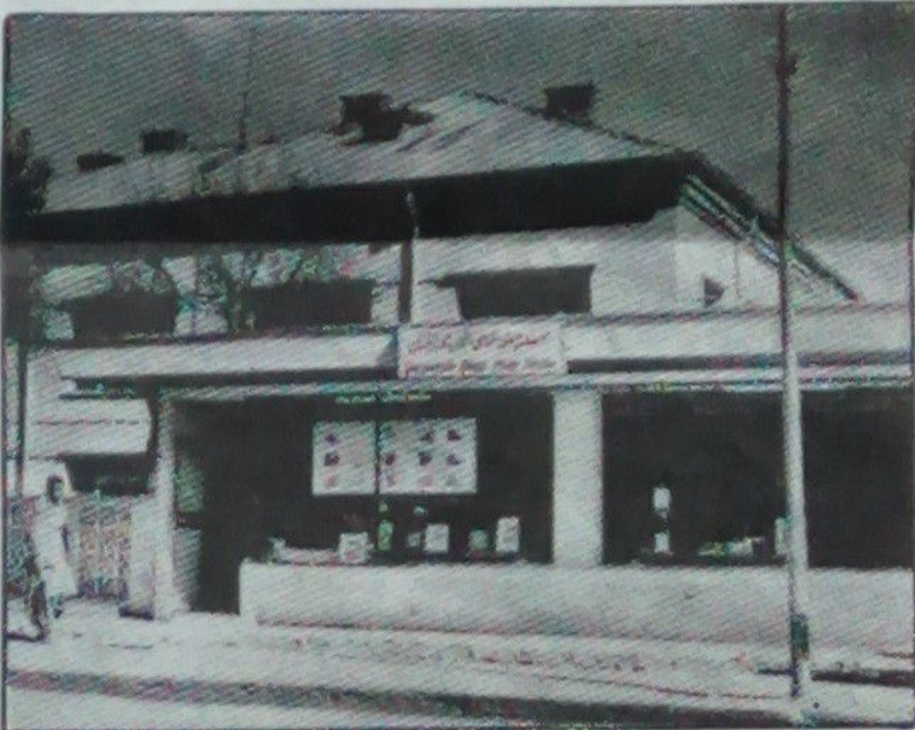
Photo studios of the Union.