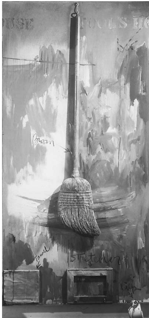
5. Fool's House (1962) by Jasper Johns. Language, theory, the object, and art. Is this a paint brush?