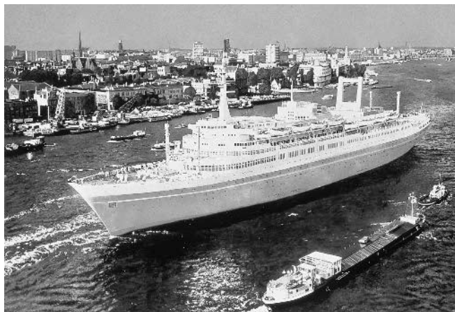
7. SS Amsterdam in Front of Rotterdam (1966) by Malcolm Morley. Is this just a big ship, or a statement about the nature of art?

Many modernist works aimed at a kind of self-explanatory autonomy ('all you need to understand' Four Quartets , in particular,