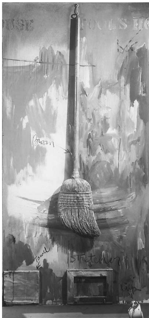
5. Fool's House (1962) by Jasper Johns. Language, theory, the object, and art. Is this a paint brush?