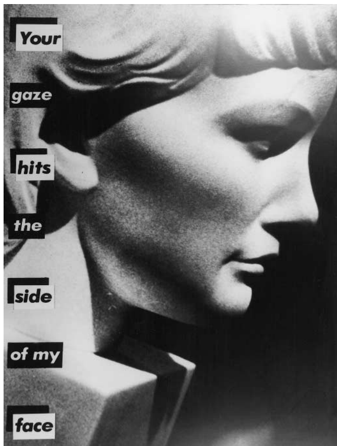
17. Untitled (Your gaze hits the side of my face) (1981) by Barbara Kruger. Art with a message: how violent is the male gaze?